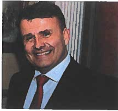
▲ The French Consul General Frédéric Joureau is also happy to pass on the Nowruz message of peace